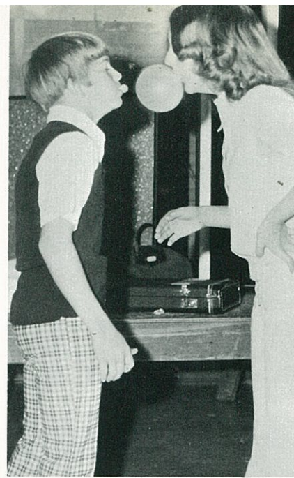
My bubble's bigger than yours.