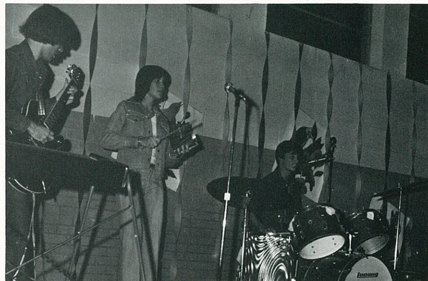
"MADDOG" entertains for Junior High Dance.